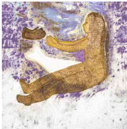
Fanny Irina, Offrande , 2023 Oil painting and pastels on canvas, 86 x 86 cm