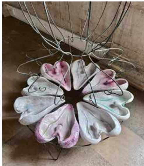
Yue Yu, ((.)) entre 8188 lèvres depuis 400 ans Glazed stoneware, ash glazes (oak, hornbeam, beech, birch, fir and ash), forged steel, 1,20m x 1,20m x 2,50m