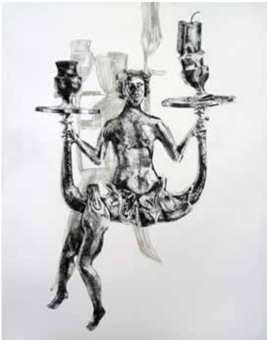
Frédérique Loutz, sans titre , 2019 India ink and colored pencil, 170 x 135 cm