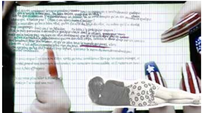
Céleste Moneger, Toujours pas New-York Video, screenshot