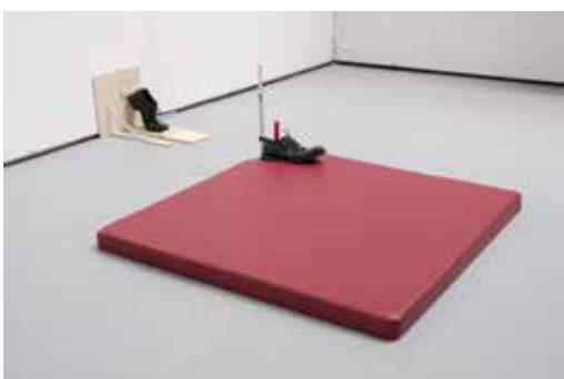
Romain Pommelet, En marche , 2023 Shoes, metal bracket, leatherette, foam, clamps, plywood, variable dimensions