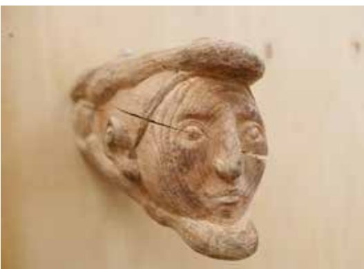
Shengqi Kong, Crocodile boy , 2022 Oak, 16 x 16 x 28 cm © ADAGP Paris 2025, Shengqi Kong