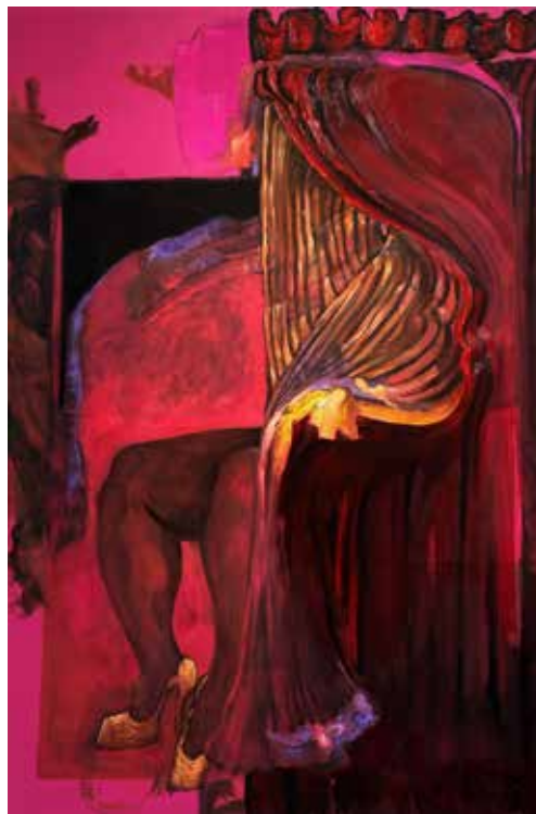
Clémence Gbonon, The curtains Oil on canvas