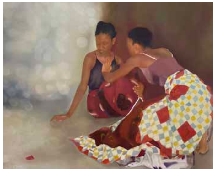
Océane Maria Adjovi, L'origine de nos actes , 2024 Oil on canvas, 162 x 130 cm