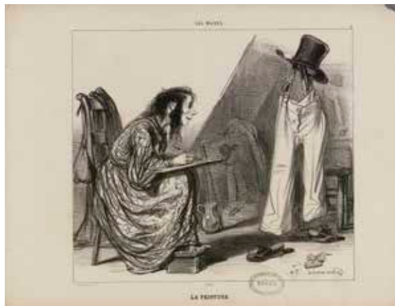
Guillaume-Sulpice Gavarni dit Paul, La Peinture , 1839 Lithography