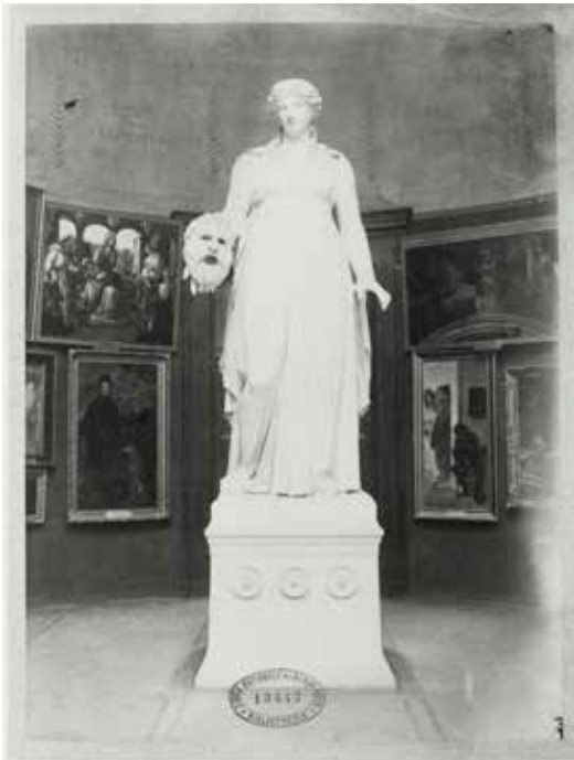
Petit Pierre, Statue de la Melpomène Albumen paper, 26 x 19 cm