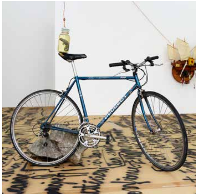
Jonathan Potana, Mouvement Primaire , Centre d'Art Ygrec - ENSAPC, 2024 Chameleon in suspended formole with copper wire on bicycle and stones, 5 x 1,3 m