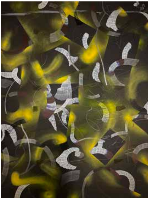
Akshay Rathore, White thing creeping in black 02 , 2022 Felt pen and aerosol on cardboard, 78 x 97 cm