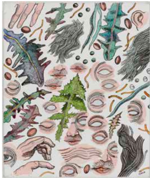
Henri Cueco, Autoportrait aux feuilles de pissenlit , 2002 Acrylic on canvas, 55,3 x 46,5 cm