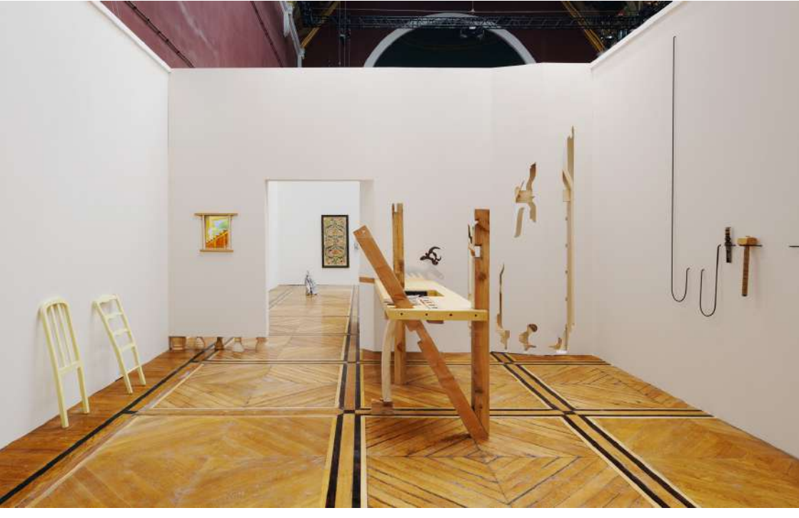
View of the exhibition Le métier de vivre. Curator: Raphaël Giannesini