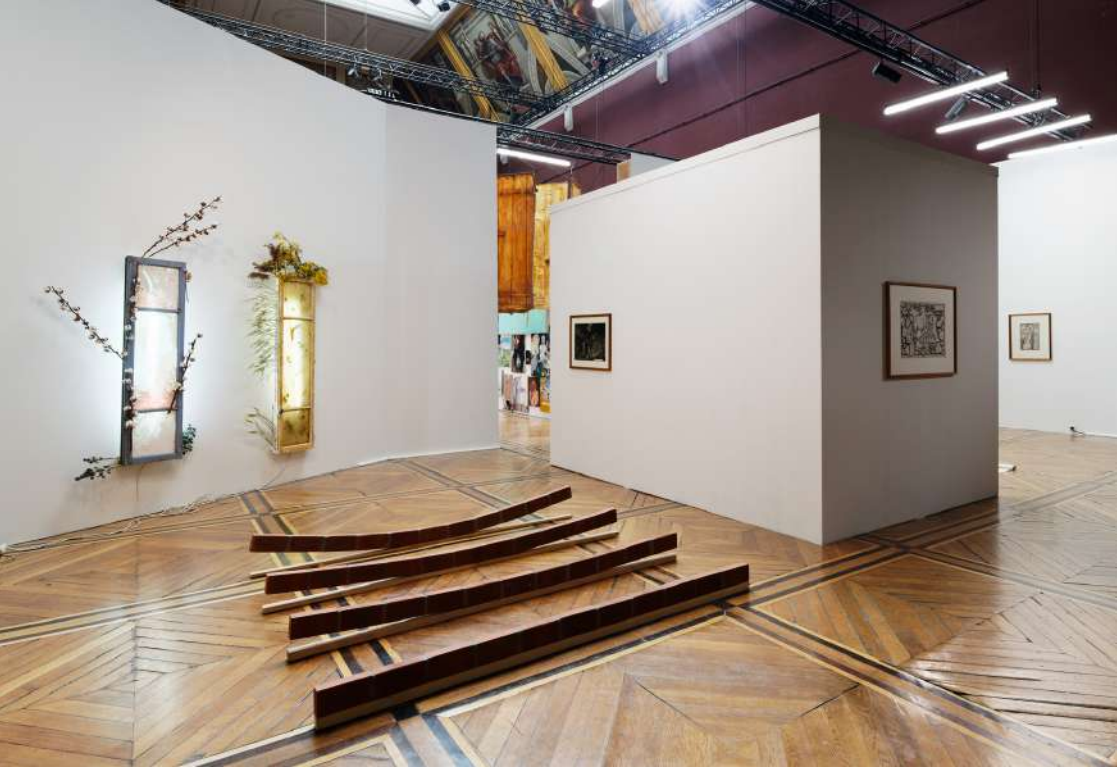
View of the exhibition Mais pour me parcourir enlève tes souliers. Curator: Violette Morisseau.